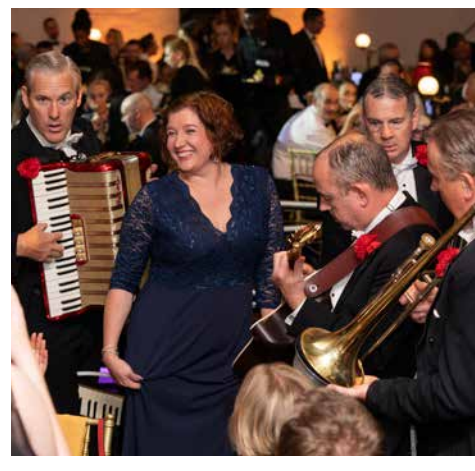
Gatsby Band at the Gala Dinner