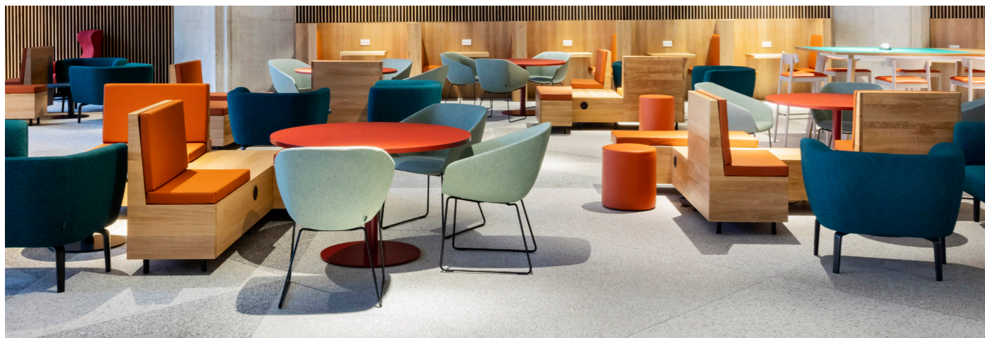
Showcase PSR are a framework supplier on the Sustainable Furniture Solutions (FFE2008NE)